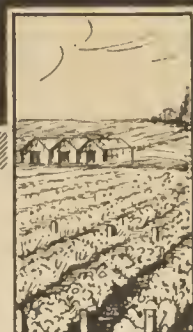
TRIAL GROUNDS VAN NUYS

A JOURNAL OF INFORMATION AND EDUCATION FOR PROGRESSIVE DEALERS